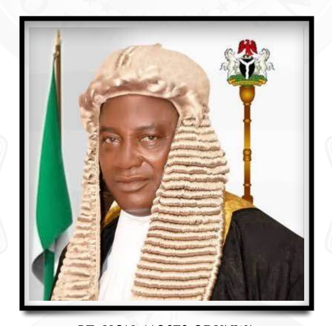
RT. HON. MOSES ODUNWA RT. HON. SPEAKER, EBONYI STATE HOUSE OF ASSEMBLY