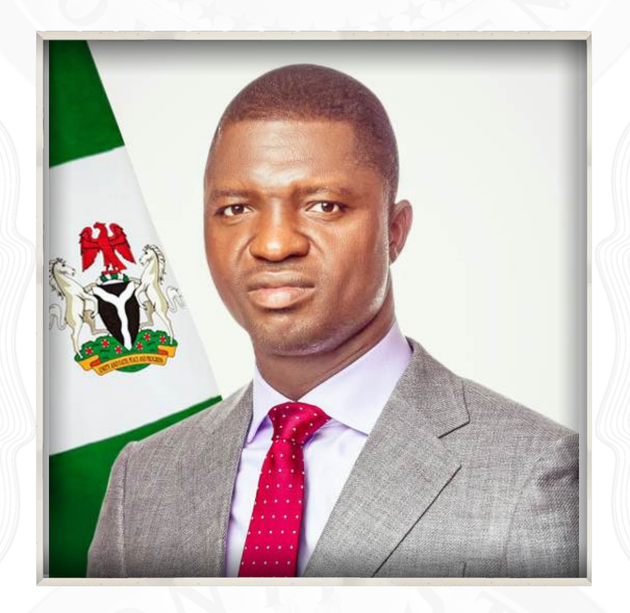
Rt. Hon. Bldr. Francis Ogbonnaya Nwifuru Executive Governor of Ebonyi State