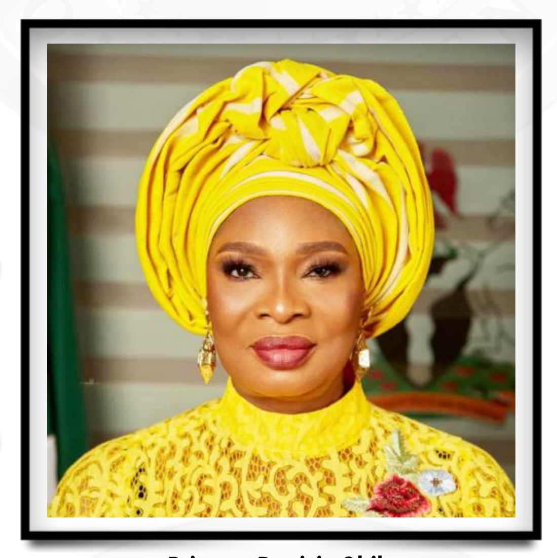
Princess Patricia Obila Deputy Governor of Ebonyi State